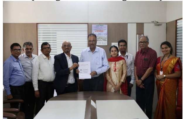
(Team-AAAWI with Chairman-team at College)