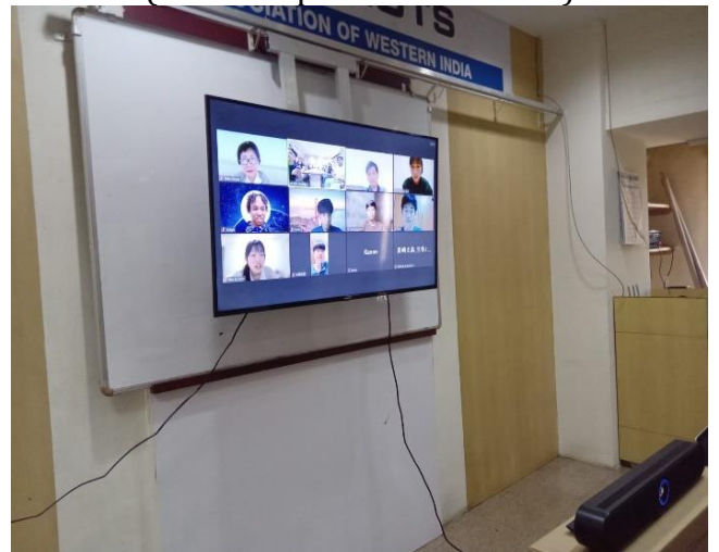
(Japanese Students joining online)