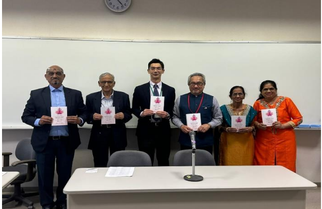
(Retired Teachers' Batch at TKC)

Mumbai-Nagasaki Students-Exchange Program: In collaboration with Nagasaki University, AAAMI, Mumbai is working under students-exchange initiative. It will help students of India and Japan, in understanding education, culture, social and technical systems and lifestyles in the respective countries. Two on-line meetings happened so far. AAAMI enrolled ten Indian students of various ages and regions to converse with Japanese students assembled at Nagasaki. A lot of discussions happened while exchanging their views on education system, entertainment, food and places of respective countries.