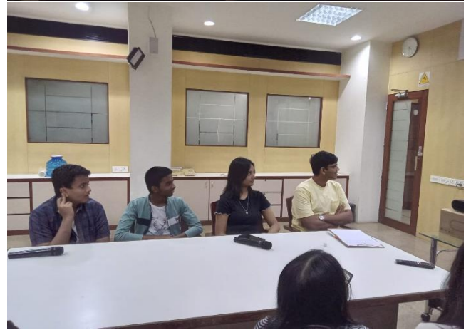
(Students present at AAAMI)