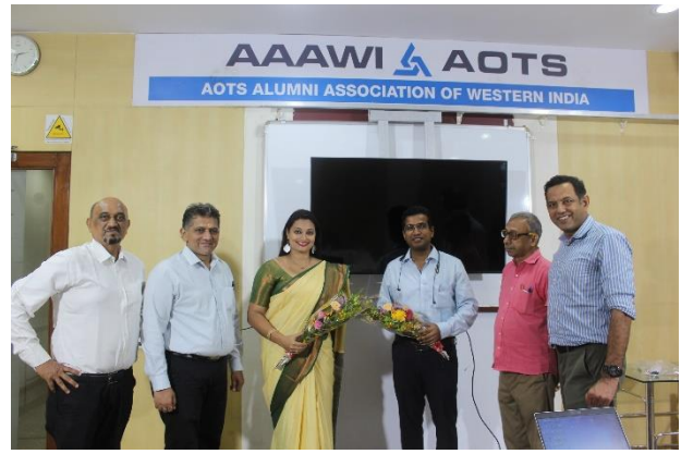
(College Team Visiting AAWWI)

AAAWI signed MoU with St. John College of Engineering and Management, Palghar, Maharashtra, for supporting in TQM and Japanese Language training, and arranging their week-long visits to Japanese companies in Vietnam, Thailand, Indonesia, Mongolia etc., through AOTS Japan. The MoU refers to study tours of students to Japan, for training in cyber security, advanced Japanese language courses, cyber security and advanced Japanese language courses etc.