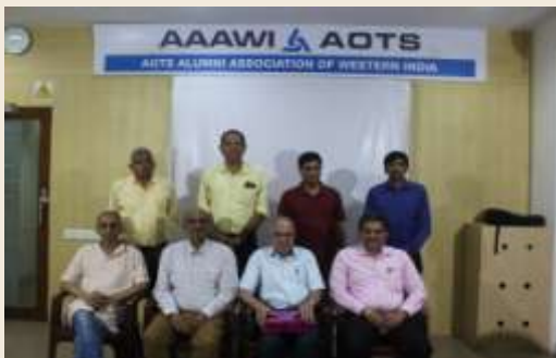
New EXECOM with Past President